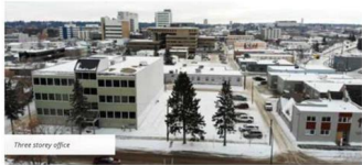
Three story office