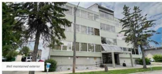
Well maintained exterior