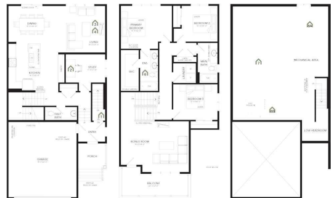
Main floor 858 sq. ft.